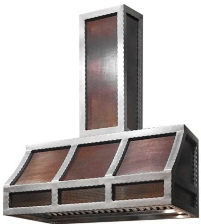
How to hammer copper sheet. What is hammered copper. Can easily be hammered into sheets.